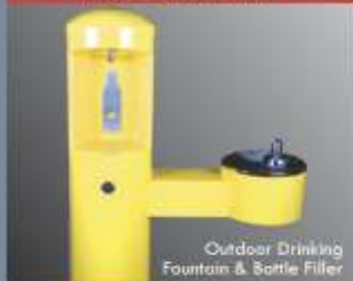
Outdoor Drinking Fountain & Bottle Filler