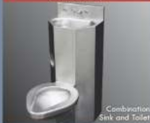
Combination Sink and Toilet