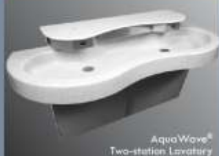
AquaWave® Two-station Lavatory