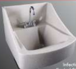
Infection Control Sink